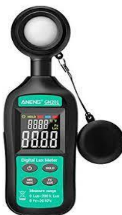
Figure 2. Luxmeter type Aneng GN201

3) The light intensity data at each coordinate is recorded and used for the creation of light intensity contour maps.